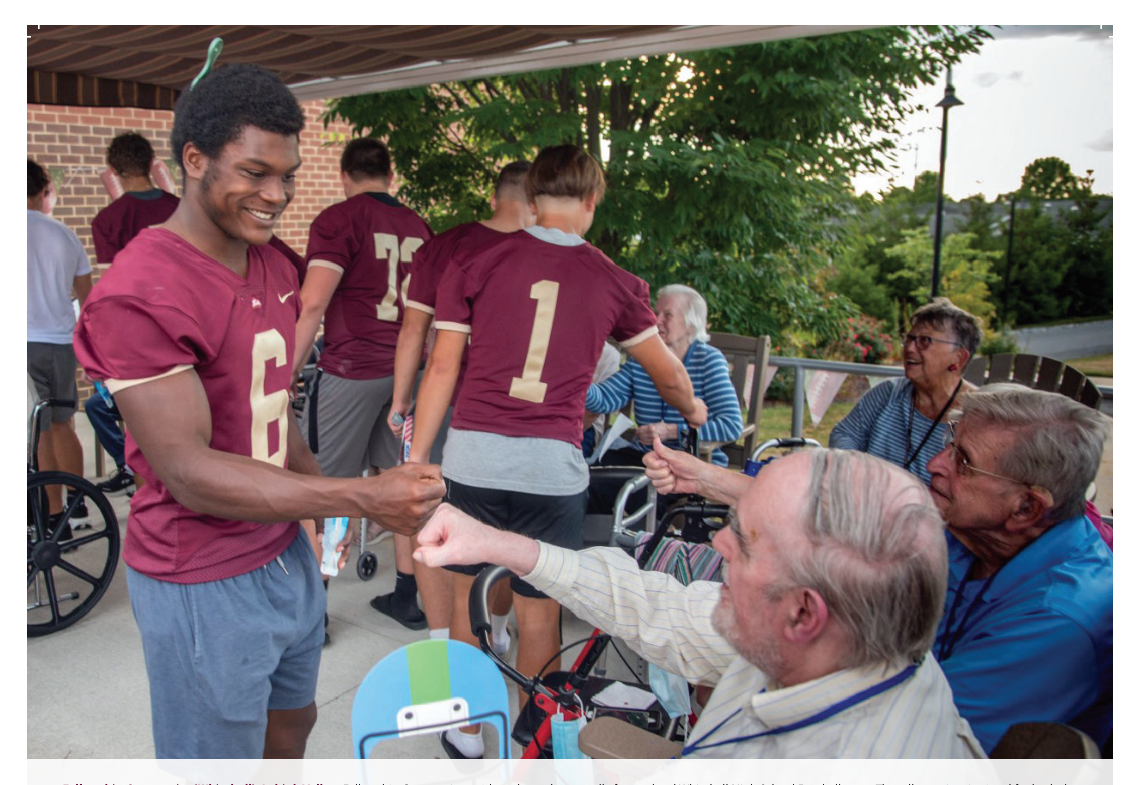
Fellowship Community (Whitehall), Lehigh Valley: Fellowship Community residents hosted a pep rally for our local Whitehall High School Football team. The rally was inspirational for both the team and our residents as they formed an intergenerational bond and mutual respect giving us hope for a future without ageism.